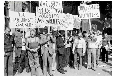
Asbestos Lobby, TUC Congress 1976

As a founding member of the Asbestos Victims Support Groups Forum UK we continue to work collectively to further the interests of asbestos victims.